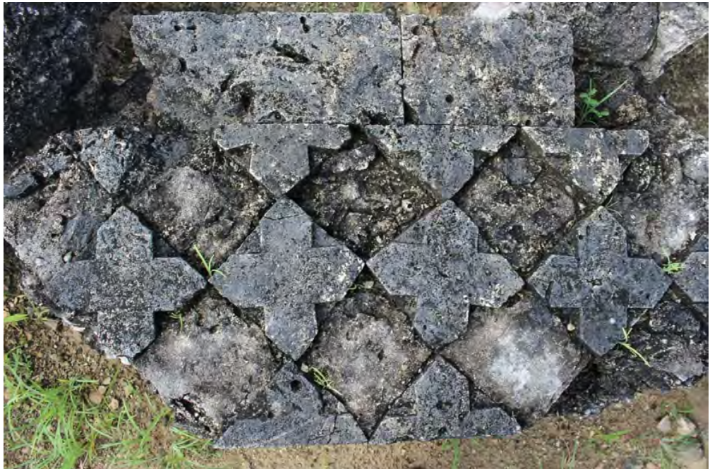
Fig. 3 Dado zone fragment from Husuni Kubwa, 1330s, Kilwa Kisiwani