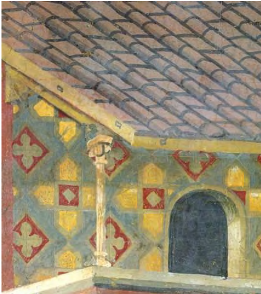
Fig. 5 Detail from Ambrogio Lorenzetti's Allegory of Good Government , 1338-1339, Siena, Palazzo Pubblico

coast has been predominantly studied by archaeologists, historians, and anthropologists, although a stronger engagement with the art and architecture along the Swahili coast would hold the potential to re-direct the discipline in significant ways.