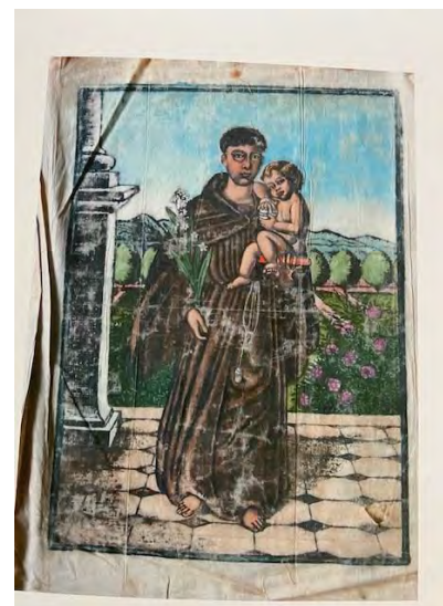
Fig. 4. Sem título (Santo Antônio mestizo). In FLORENCE, 2009, p. 124.

As a printed result, Polygraphy increased the vividness of the images obtained, keeping them within the contour lines and even allowing the thickness of the hachures to vary. To him, vividness was a fundamental aesthetic category because it expressed the uniqueness of the tropical world. This method highlighted the meaning of each color as in this set of three Sant Anthony images, each color, a skin color: white, black, and mestizo, which was aimed at different audiences, and the image of the Saint could have local uses.