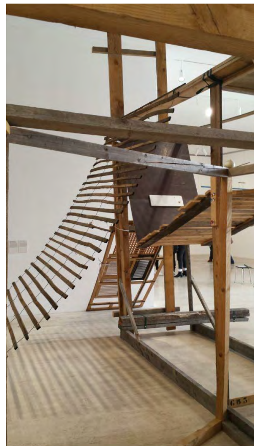
Fig. 2. Jumex Museum, Mexico City, exposition of Abraham Cruzvillegas "Autoconstrucción," 2009; photograph: Peter Krieger

slums. The comparison clearly shows that Cruzvillegas' work is not a mere representation of a slum area but a "reproduction of its constructive dynamics" and its aesthetic potential, which "implies an approach to sculpture involving improvisation and instability, and a constant process of learning: about materials, people and himself," quoting former Tate Modern director Chris Dercon. 6