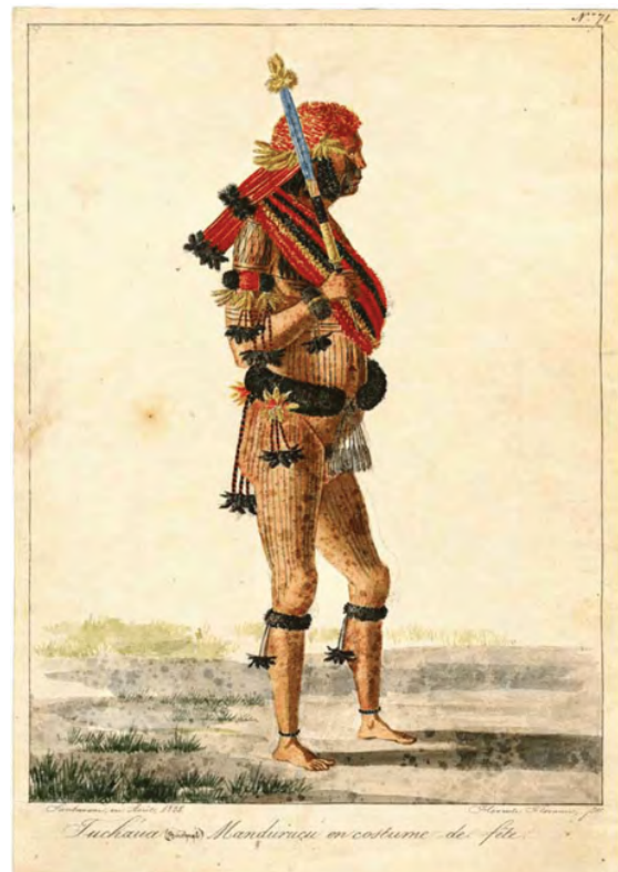
Fig. 1. Tucháua. Chefe Munduruku em traje de festa. Hercule Florence, Santarém, 1828. In Expedição Langsdorff. Catálogo de exposição. Rio de Janeiro, CCB, 2010, p. 193.

He visually described this multiethnic population based on his cultivated sense of observation. He paid attention to the shapes of their bodily marks, ornaments, utensils, and houses. In particular, he favored body marks and paintings, especially in graphics: extension, position on the body, symmetry, texture, color, and line width in the individual and group. It was a detailed study of adornment as a visual practice of the early civilizational stages. In this historical situation, each civilization stage had its cultural materiality.