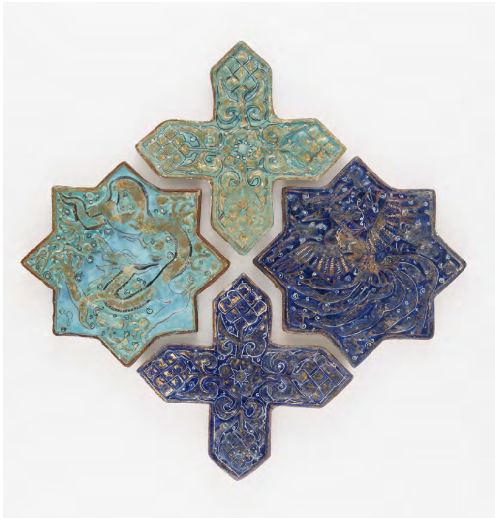
Fig. 4 Star and cross tiles, ca. 1270-1280, Iran, probably Takht-i Sulaiman, Los Angeles County Museum of Art