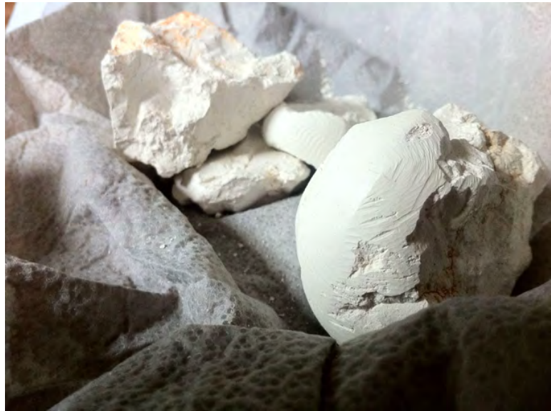
Fig. 2. Sample of gapan (white clay) used in bark painting.

able to work out that bark paintings were made close to where the ochre was collected. 37 My colleagues and I were able to work that out as well when Mr. and Mrs. Wanambi showed us the spot (Fig. 3).