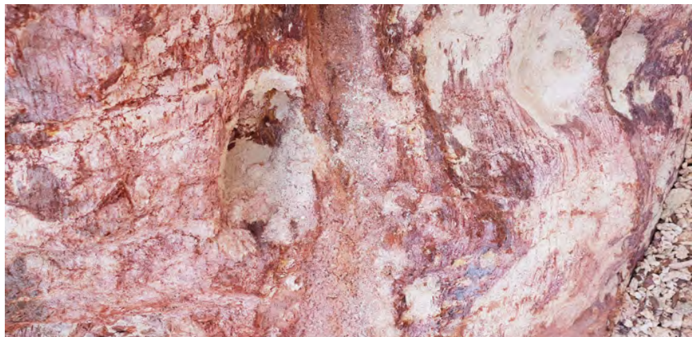
Fig. 3. Nuwal ochre pit near Yirrkala, North east Arnhem Land.