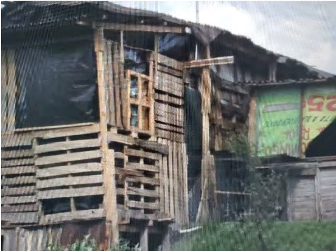
Fig. 1. Still from the film Autoconstrucción , 2009, Abraham Cruzvillegas, director. Photograph: screenshot

Comparing a self-built slum house in the Colonia Ajusco and an installation in the Jumex Museum of Mexico City may illustrate this conceptual transfer. A still from the film “Autoconstrucción” of 2009 [fig.1] shows how a dweller of this site reuses wooden pallets for wall construction, including a crafted wooden lattice window. Openings of this unfinished façade are covered with dark plastic sheeting, and roofing felt. As the artistic director of this film, Cruzvillegas highlighted this structural motive, which, five years later, [fig. 2] in his Jumex exhibition appeared in one of his installations, which revived constructive ideas, recycled wooden material, and recodified the aesthetics of poverty as a creative driving force, revealing the complex and contradictory “strata of experience” in the visual anarchy of