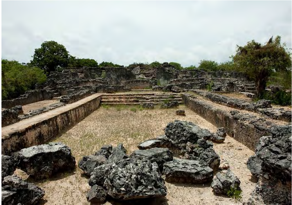
Fig. 2 Husuni Kubwa, 14 th century, Kilwa Kisiwani