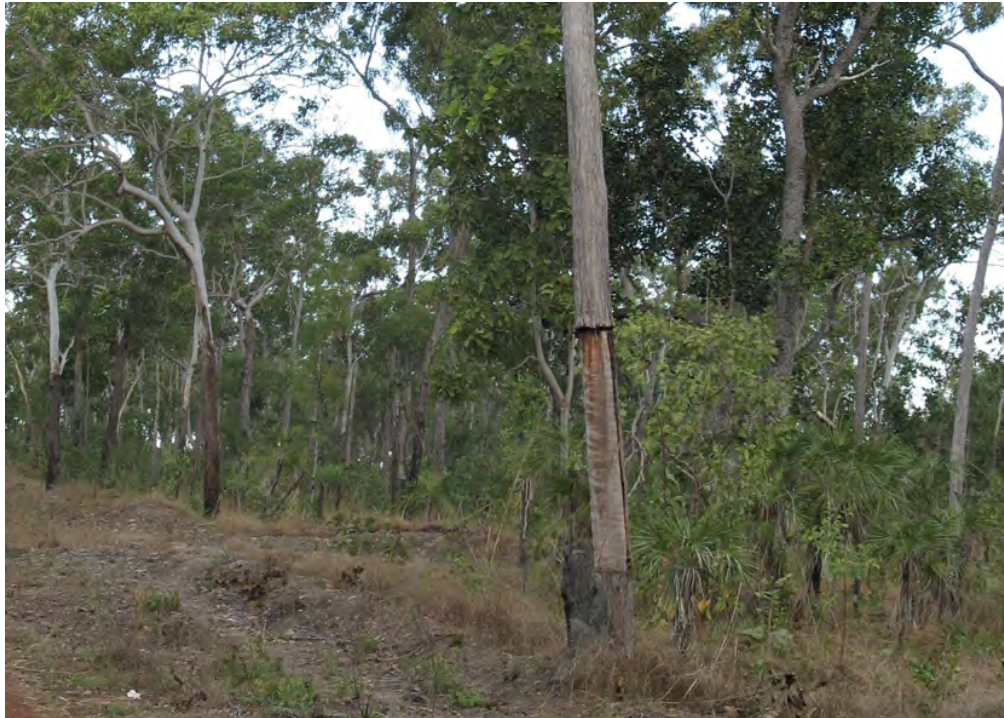
Fig. 1. Gadayka (stringybark tree), eucalyptus tetrodonta , commonly known as Darwin stringybark or messmate, endemic to northern Australia, with a section removed for bark painting.

right time to cut the tree to remove the bark so that it comes off in a sheet and does not split. Unfortunately, in most cases, the tree dies as a result (Fig. 1).