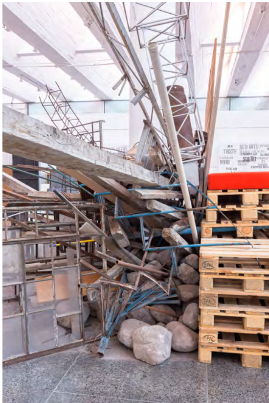
Fig. 3. MUCA, Ciudad Universitaria, Mexico City, exposition “Autorreconstrucción: Detritus,” 2017

“Autoconstrucción” installations. A randomized compilation of waste is the raw material for his artisanal and artistic work. However, the artist does not understand himself as a „scavenger“, but as a composer of valuable material, thus breaking a taboo of the consumerist society, and generating critical environmental consciousness.