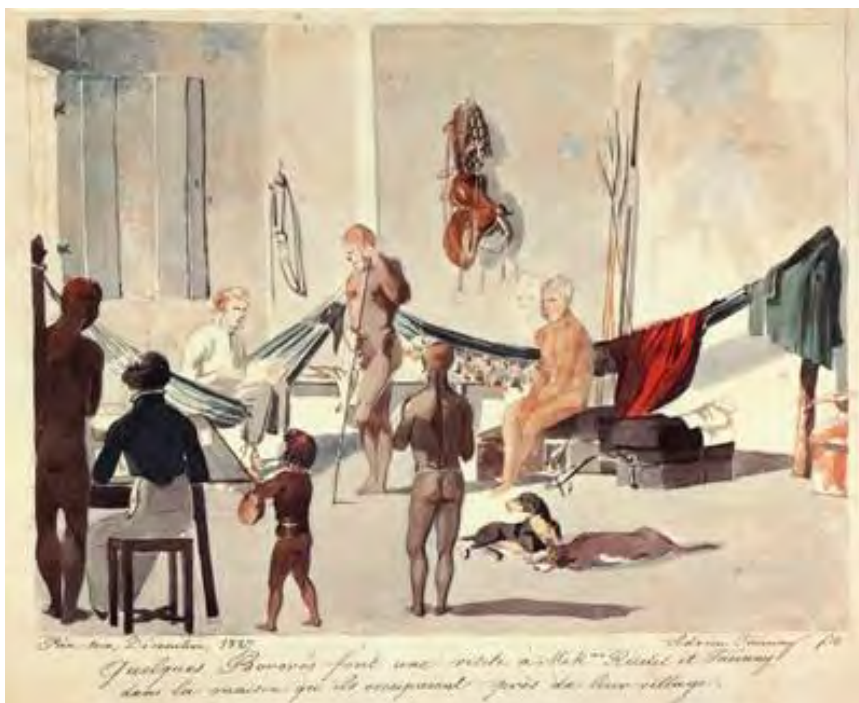
Fig. 2. Alguns Bororo em visita a Riedel e Taunay, na casa que ocuparam perto da aldeia. Aimé-Adrien Taunay, 1827. In Expedição Langsdorff, 2010, p. 168-169.

On the other hand, cross-cultural relationships could shape the materiality of the images. During the Langsdorff expedition, Aimé-Adrien Taunay made a board on which he and Ludwig Riedel were involved in drawing or coloring illustrations. They are closely followed by five Indigenous people in a lodge - perhaps Bororo. We can sense a conversation in the air, suggested by the relaxed position of the bodies, the easy gestures, and the mutual interest. The artist is not alone in a studio with the materials recovered. The image-making in the locality has an immersive dimension in a globally perceived world. The Indigenous seem to observe, perhaps comment on the making of the image, intervening.