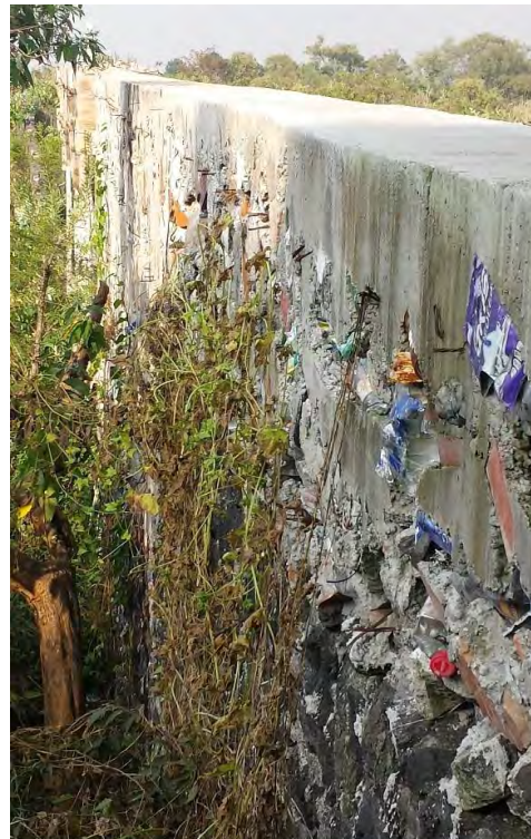
Fig. 4. Garbage Wall at the REPSA, 2015/2016, Abraham Cruzvillegas

Part of the waste was collected at the nearby Ecological Reserve of the Stony Desert at San Ángel (Reserva Ecológica del Pedregal de San Ángel, REPSA), 21 where Cruzvillega in 2015/2016 had erected a garbage wall [fig. 4] – denouncing that protected wilderness, 22 in this case with a high level of geo and biodiversity, commonly is getting debased as a none-site for garbage. 23