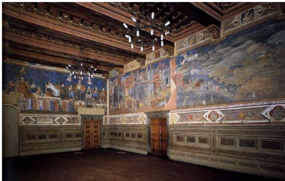
Fig. 1 Ambrogio Lorenzetti, Allegory of Good Government , 1338–1339, Siena, Palazzo Pubblico

When the discipline of art history started to increasingly re-direct its attention to global horizons during the past decades, 1 this came along with the establishment of new canons, canonical images, and objects of global art histories. The works of Ambrogio Lorenzetti count among the most well-known of these (Fig. 1), 2 as does the emphasis on long-distance travels of merchants, diplomats, and missionaries between the Mediterranean, the Middle East, and Asia during that period, migrations of people that came along with the mobility of objects, transcultural dynamics, and complex intersections between visual and material culture such as depictions of imported luxury fabrics from Central Asia and the Middle East in Italian paintings. 3 None of these topics were really new in scholarship; in fact, particularly the renewed focus on fourteenth-century Eurasian interactions during the past twenty years in disciplines such as history and art history shows how much global art history has also been drawing on and reconceptualizing discourses from the nineteenth and early twentieth centuries. Gustave Soulier's Oriental Influences in Italian Painting and Ivan