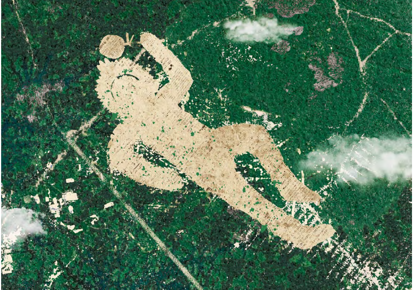
Fig. 2. Natureza Morta 2 (2016-2019). Infogravura.