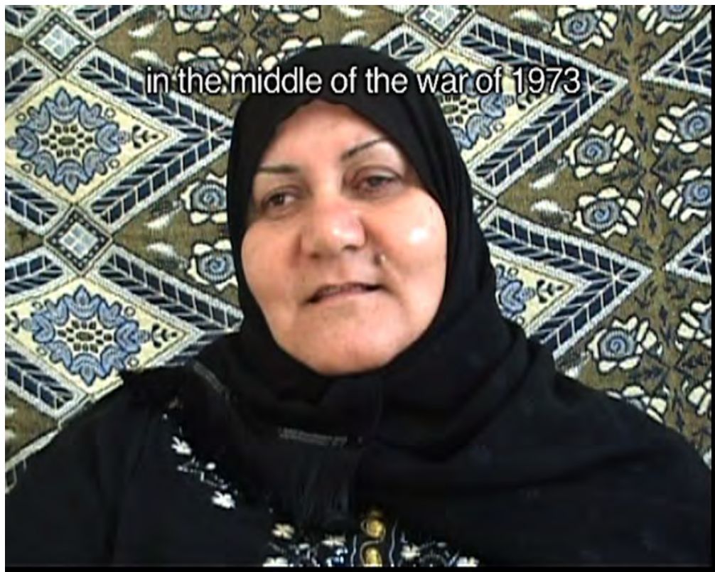
Fig. 3. Hamdiah; Gaza, Palestina

testify. My primary goal was to explore the possibility of an aesthetic understanding that, by means of its own intimacy across the gaps of globalization, can engage the political. The proximity presupposed by the sense-based experience also establishes intimacy between the subject and the “object” of the aesthetic moment. Hence, this approach furthers my attempt to develop a method that approximates the “object” to becoming a subject, not as the anthropological subjects subjected to the researcher’s gaze, but as full co-authors of their image.