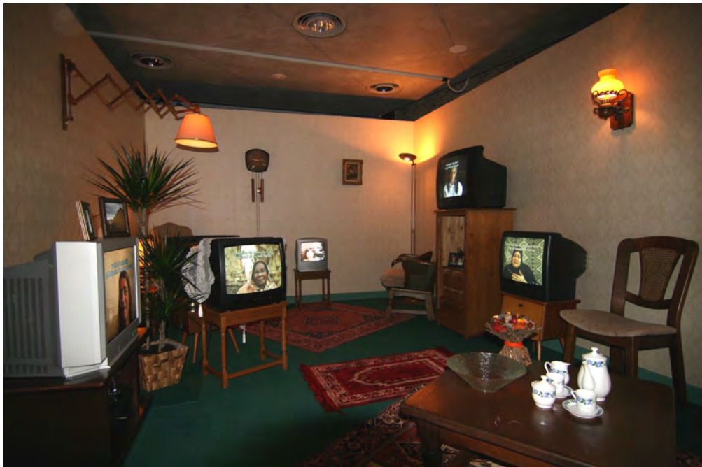
Fig. 2. Zuiderzeemuseum, Enkhuizen

The women in the installation live in various countries from which people have migrated since the onset of modern-day globalization. Still living in their home countries, they all saw a child leave to Western Europe or to the USA. If we are to understand the possibility of a universal such as motherhood through insight into the intimate local relationships against the backdrop of a globalized world, we must, first of all, realize the enormity of the changes in the lives and life experiences of individuals taking this drastic step. We must wonder, that is, why people decide they must leave behind their affective ties, relatives, friends, and habits – in short, everything that constitutes their intimate everyday lives. Imagine! These motivations, which are too complex to allow any generalizations, tend to include economic necessity but are rarely limited to that overarching issue.