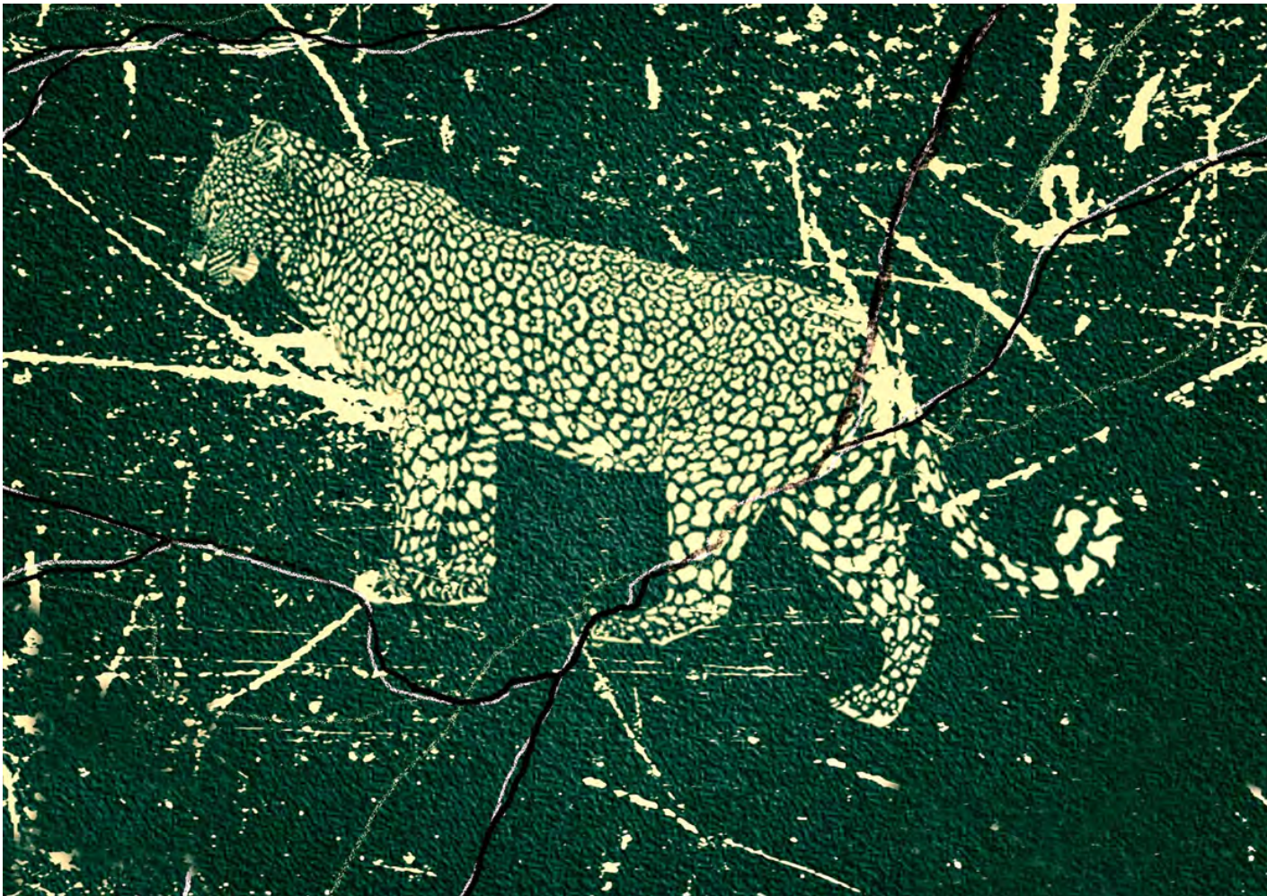
Fig. 1. Natureza Morta 1 (2016–2019). Infogravura.