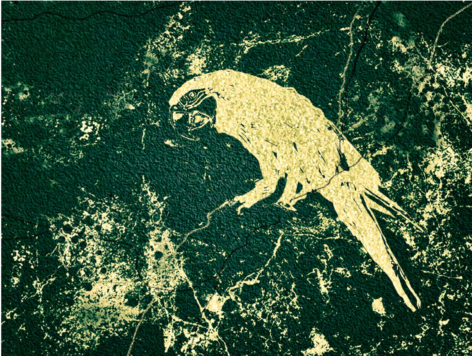
Fig. 3. Natureza Morta 3 (2016-2019). Infogravura.